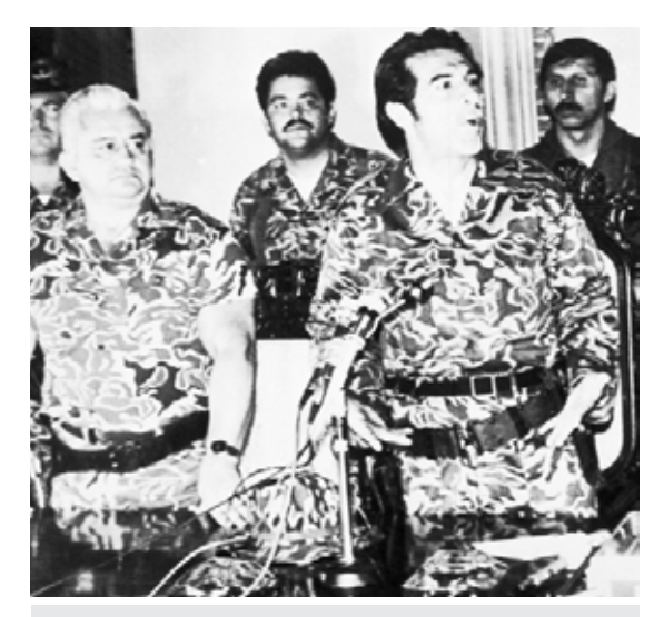
General Efrin Rios Montt (center), at a press conference in Guatemala City on March 23, 1982, after having over thrown the government of General Fernando Romero Lucas Garcia.

It is never easy to try genocide, and this case was no exception. The prosecution's strategy relied on a combination of military documents and reports, eyewitnesses, and experts, including dozens of forensics experts who had conducted exhumations of graves in Quiche. Nearly 100 eyewitnesses and survivors testified to repeated patterns of gruesome massacres, mass rape, torture, destruction, and persecu-