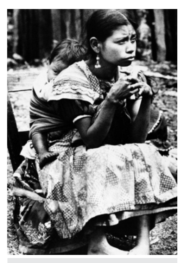
Young woman and her child at a refugee camp in Santiago El Vertice, Mexico in 1982. The camp was one of several established to protect the Mayan communities fleeing the war in Guatemala.

As the trial progressed, even former military figures and conservative politicians seemed to agree that atrocities had been committed, and indeed had been committed by the military (though they claimed that the guerrillas were also responsible). This represents a step forward in the country's political discourse. However, for a number of former