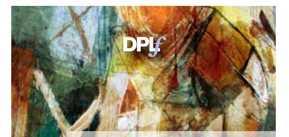
Digest of Latin American jurisprudence on international crimes Volume II

In this regard, one of the most salient aspects of the evolution of Latin American justice is the transfer of these debates from the constitutional realm to criminal trials. This entails the effective exercise, in many cases, of constitutional oversight of the