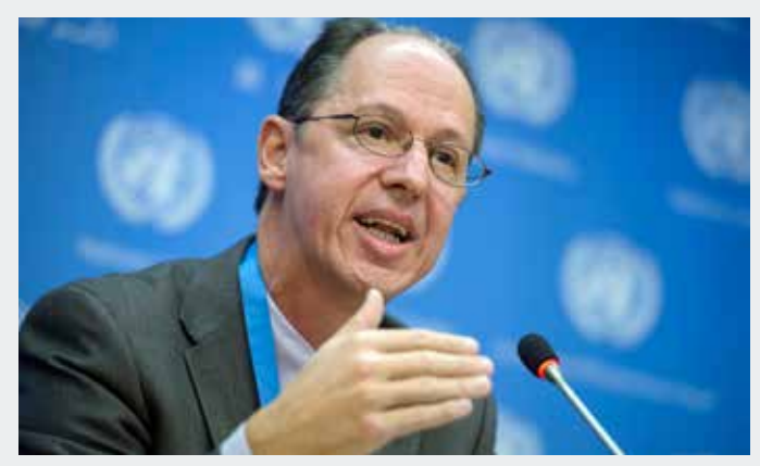
Pablo de Greiff.

In the resolution creating this special procedure<sup>1</sup>, the Council underscored the importance of a comprehensive approach that encompasses the four elements of the mandate of the Office of the Rapporteur (truth, justice, reparations and guarantee of non-recurrence) and: