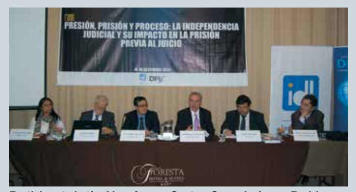
Participants in the Lima forum. Center: Commissioner Rodrigo Escobar Gil.

In Lima, on September 10, 2013, a forum was held entitled "Prison, Pressure, and Procedure: Judicial Independence and Its Impact on Pretrial Detention," organized by DPLF and IDL. One of the presenters at this conference was Commissioner Rodrigo Escobar Gil, the Rapporteur on the Rights of Persons Deprived of Liberty of the Inter-American Commission on Human Rights. He discussed the main problems that result in the violation of the rights of detainees in different countries of the region and the need for States to use pre-trial detention only for precautionary purposes and according to the standards of exceptional circumstances.