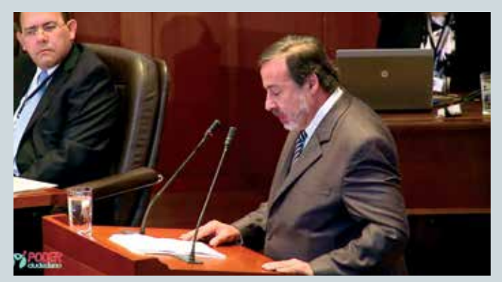
Gustavo Gallón in a public audience at the Constitutional Court of Colombia, in july 2013.

CCJ filed an unconstitutionality action challenging Article 1 of Legislative Act 01 of 2012, known as the Legal Framework for Peace. The action alleged the framework's incompatibility with "the pillar originally established by the 1991 Constitution, according to which it is the duty of the State to guarantee the rights of all persons residing in Colombia and, therefore, to properly inves tigate and prosecute all grave human rights violations and gross violations of international humanitarian law committed within its jurisdiction ". This incompatibility arises from the fact that the framework allows the state to investigate only those most responsible for human rights violations, and only for those acts that constitute systematically committed war crimes.