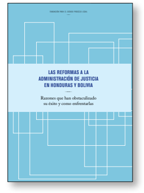
Las Reformas a la Administración de Justicia en Honduras y Bolivia: Razones que han obstaculizado su éxito y como enfrentarlas (Available in Spanish)