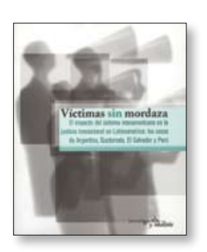
Víctimas sin Mordaza (Spanish version of DPLF 2007 publication Victims Unsilenced)

Publishing studies and seminar reports from our various projects, as well as distributing those publications to the greatest extent possible, remains an integral part of DPLF's work. In addition to posting our publications on the organization's Web site, we disseminate them as widely as possible in Latin America, the United States, and Europe. This year DPLF issued the following publications: