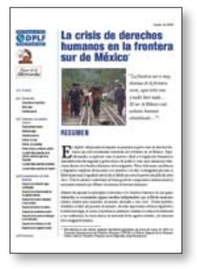
La crisis de derechos humanos en la frontera sur de México (Available in Spanish)