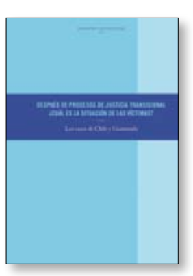
Después de Procesos de Justicia Transicional ¿Cuál es la situación de las victimas?: Los casos de Chile y Guatemala (Available in Spanish)