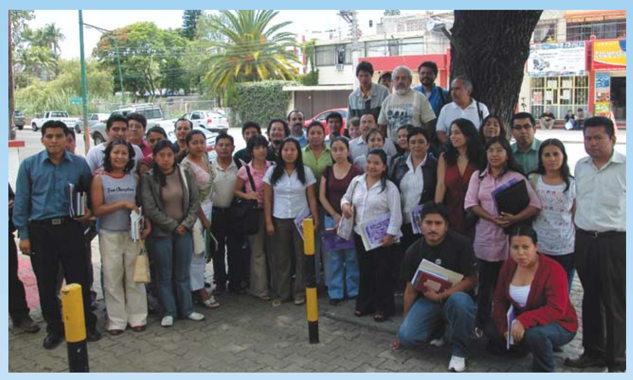
Participants of DPLF's international training session held in Oaxaca, Mexico.

In coordination with American University's Department of Government (Washington D.C) and the Universidad Autónoma Benito Juarez of Oaxaca, DPLF is carrying out a 3-year contract with US-AID's TIES program that includes research and training activities on issues surrounding the -sometimes conflictive- relationship between official law and customary law in Oaxaca, where most of the population belongs to an indigenous group. 2008 was the second of the 3 year project. In August 2008, DPLF organized a two week international training session in Oaxaca. Classes were imparted by experts from the United States, France, Colombia, Peru, Ecuador, Mexico City and Oaxaca. The participants in the training sessions were not only lawyers but social scientists, state authorities and indigenous authorities as well.