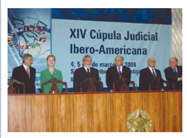
Presidente Lula inaugurated the XIV Cumbre Judicial Iberoamericana.

DPLF was the only non-governmental organization that participated as a special observer in the General Assembly of the XIV Iberian American Judicial Summit , held March 4-6, 2008 in Brasilia, Brazil. The Iberian American Judicial Summit is a coordination and cooperation platform of the twenty three Judiciaries of Latin America, Spain and Portugal. The Rules of Brasilia on Access to Justice for Vulnerable Groups was approved by the members at the conclusion of the Summit. DPLF participated in the discussion of the preliminary documents through technical assistance to the Costa Rican Supreme Court and is now member of the working group created to follow up these rules.