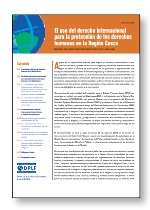
El uso del derecho internacional para la protección de los derechos humanos en la Región Cusco (Available in Spanish)