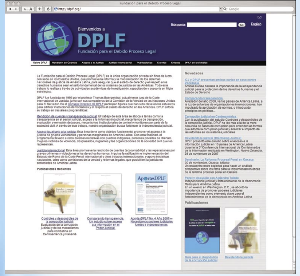
DPLF's Web site: www.dplf.org, redesigned and launched in 2007.

DPLF redesigned and launched a new Web site in 2007. The new site continues our commitment to making the information and publications resulting from our various projects available to the widest possible audience by having those documents available for downloading in their entirety on the site. Hard copies of most of the publications are still available upon request. We continue to upload additional documents and information almost daily, including to a new Documentation Center, which contains various laws related to the region's struggle for judicial accountability and transparency (under JAT section).